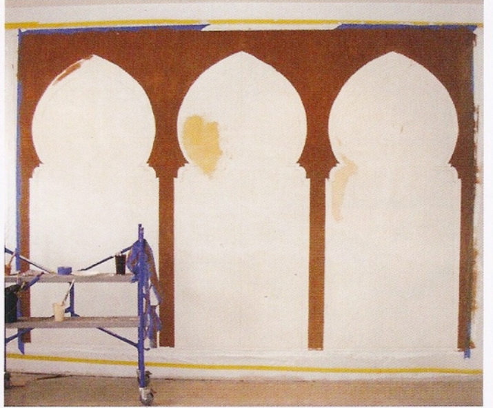
Dining Room: Industrial strength velcro was used to hold the canvas mural in place.

The Final Solution: Two panels placed on both sides of the fireplace were finished to match the hand-painted camel bone veneer doors above the fireplace that were imported from Morocco. To replicate the veneer on the doors, the panels were finished using a bone pearlescent finish and stencils were applied using LusterStone with colors hand painted onto the raised stencils for detail in three separate layers. 70 ft. of trim was faux finished, stenciled and hand painted in three layers and cut to size. Finished panels were attached to framework in three separate sections that were installed on site. Faux finished trim was applied to assembled pieces to make them appear as one large artwork. Upholstery tacks were added for additional detail. The artist used Faux Effects® Metallic Pearl, Gold and Silver Palette Deco, Snowflake LusterStone, and French Red and Turquoise FauxColor to create the Moroccan panels.