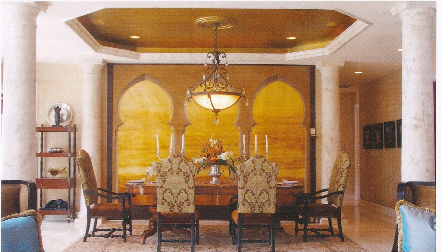
Dining Room After.

The Final Solution: Two panels placed on both sides of the fireplace were finished to match the hand-painted camel bone veneer doors above the fireplace that were imported from Morocco. To replicate the veneer on the doors, the panels were finished using a bone pearlescent finish and stencils were applied using LusterStone with colors hand painted onto the raised stencils for detail in three separate layers. 70 ft. of trim was faux finished, stenciled and hand painted in three layers and cut to size. Finished panels were attached to framework in three separate sections that were installed on site. Faux finished trim was applied to assembled pieces to make them appear as one large artwork. Upholstery tacks were added for additional detail. The artist used Faux Effects® Metallic Pearl, Gold and Silver Palette Deco, Snowflake LusterStone, and French Red and Turquoise FauxColor to create the Moroccan panels.