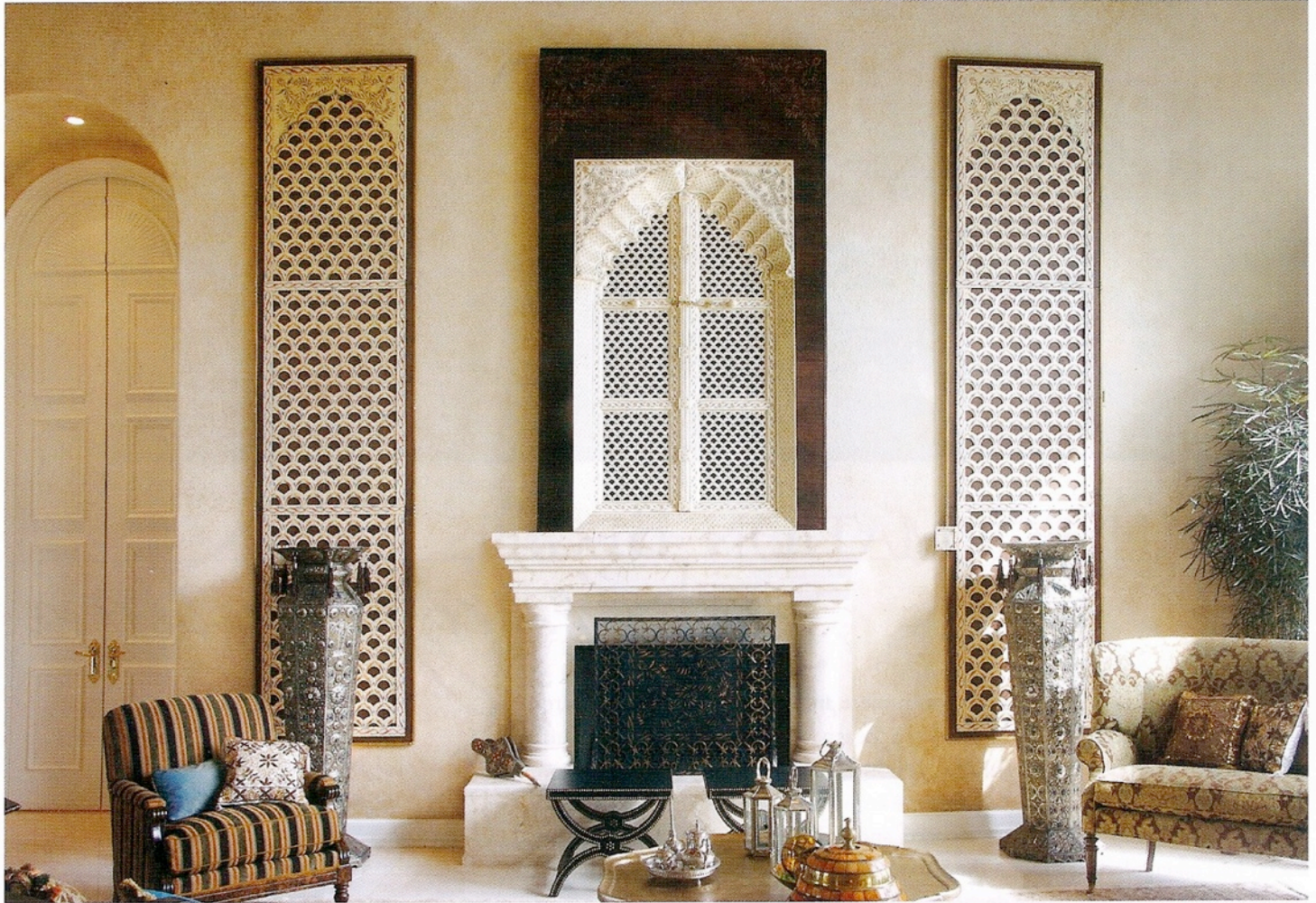
Living Room After.