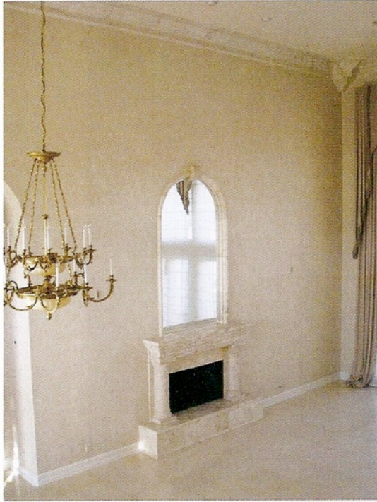
Living Room Before: The client wanted to cover the mirror without removing it.