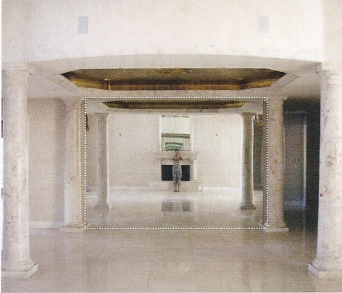
Dining Room Before: The wall length mirror (outlined above) posed a challenge to cover.