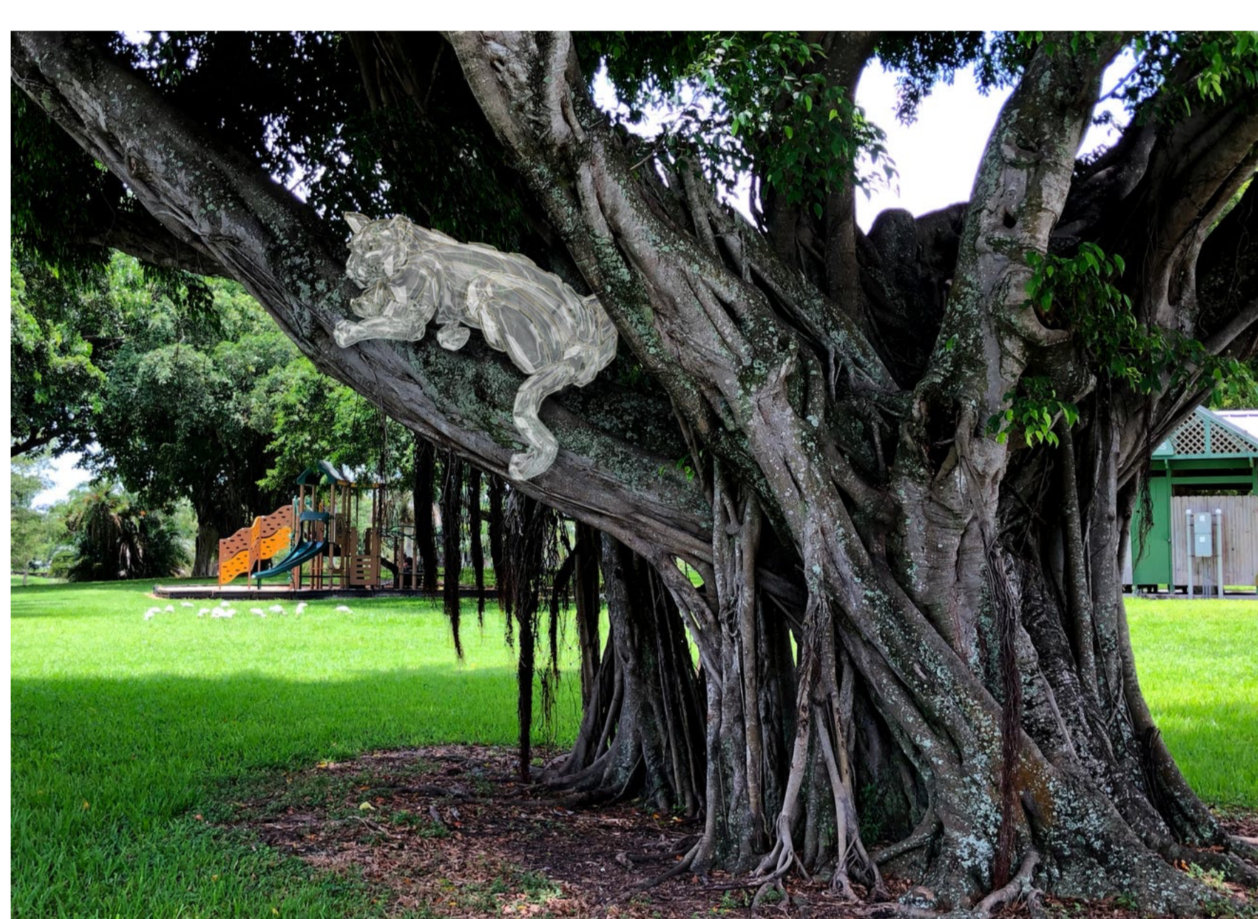
Gregory Dirr's Spirits of South Florida, at Dreher Park near Palm Beach Zoo, will show nature emerging even as humans retreat from the pandemic.

In Dreher Park, near the Palm Beach Zoo, you may spot a sculpted coyote on the prowl, a panther crouched overhead on a limb, a swordfish surfacing from a pond, works called "Spirits of Florida," by artist Gregory Dirr, who will focus on species threatened with extinction. The zoo plans to create an educational program that incorporates the pieces.